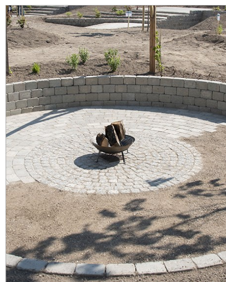
Example of practical Final Test